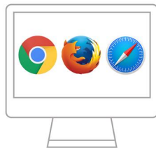
PC and Mac Chrome | Firefox | Safari